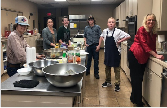
February 12th Spaghetti Dinner fundraiser was a big success. It was fun to cook and serve our dinner guests and earn money for camp.