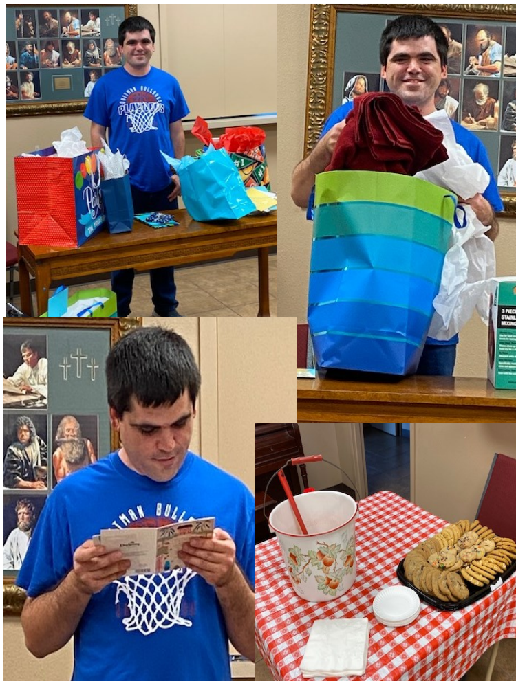
Gifts and gift cards (even easy to spend cash) played a part in the pounding!