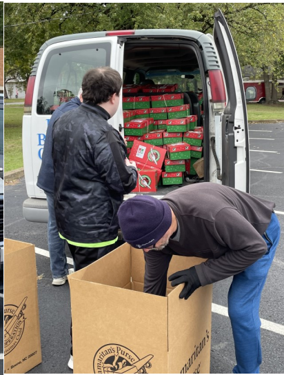
Operation Christmas Child