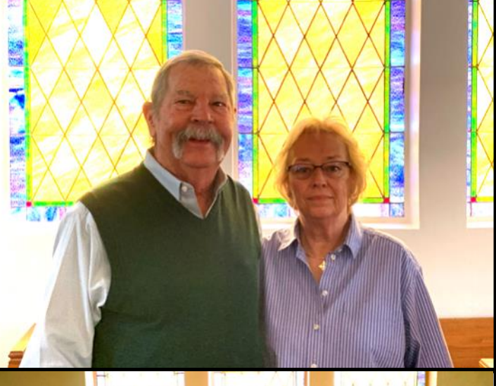
The Armstrong Family