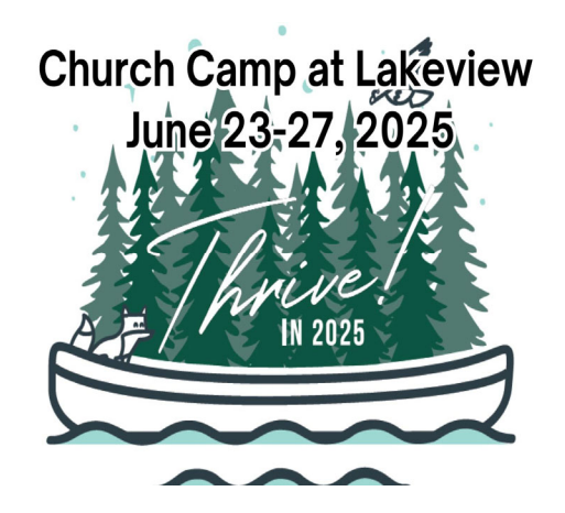
The camp is open to 1st graders thru graduated seniors.