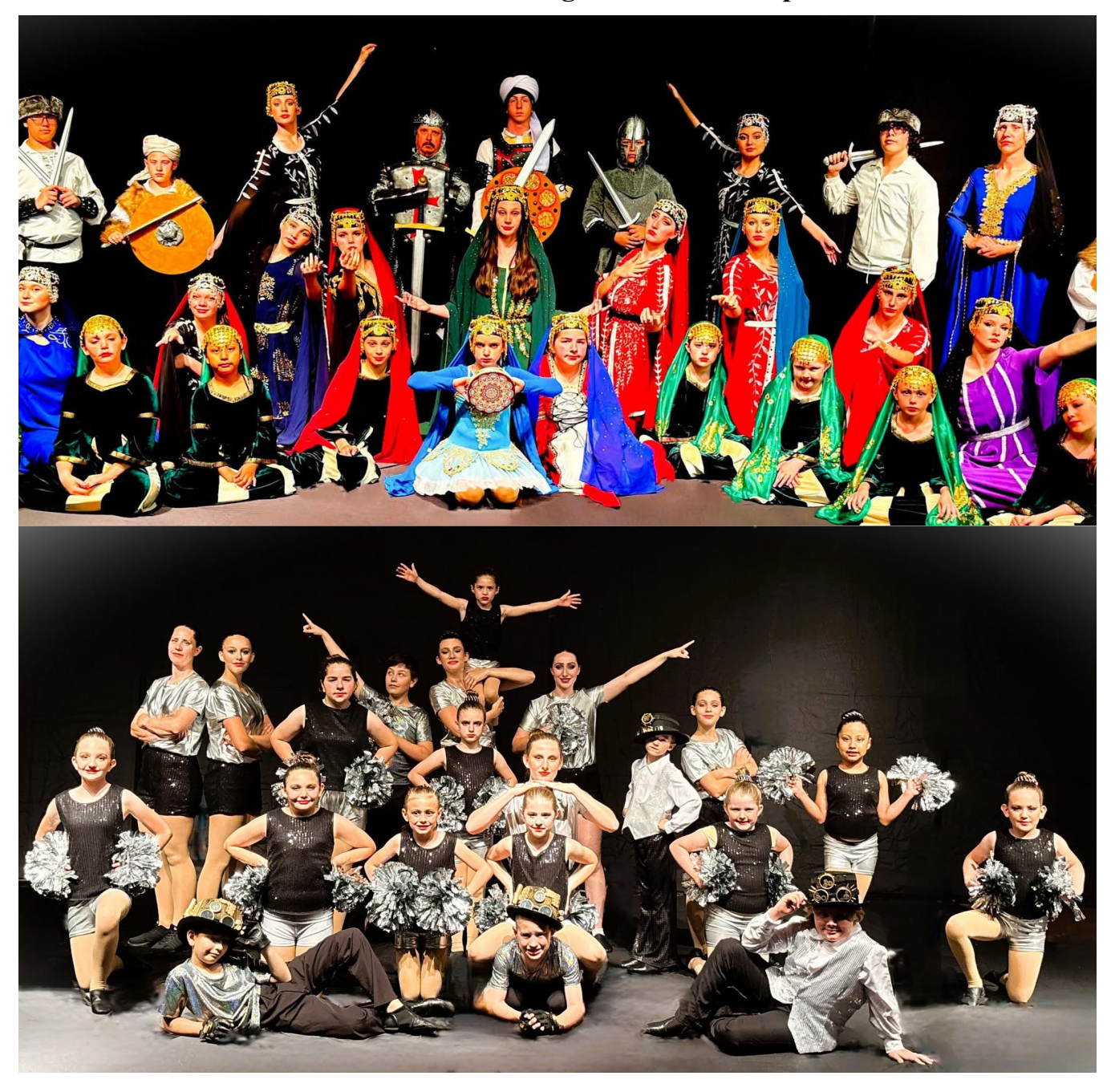
A Wonderful Relationship Was Established with the Non-Profit Deseret Dance Troup Over the First Half of 2025. We look forward to Continuing this Relationship in the Fall.