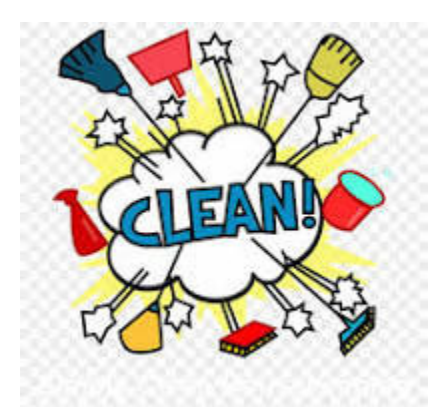
June 2 - June 5

Volunteers will be working in the Youth Area (The WELL) to make it more functional and to spiffy up the kitchen and other ancillary areas.