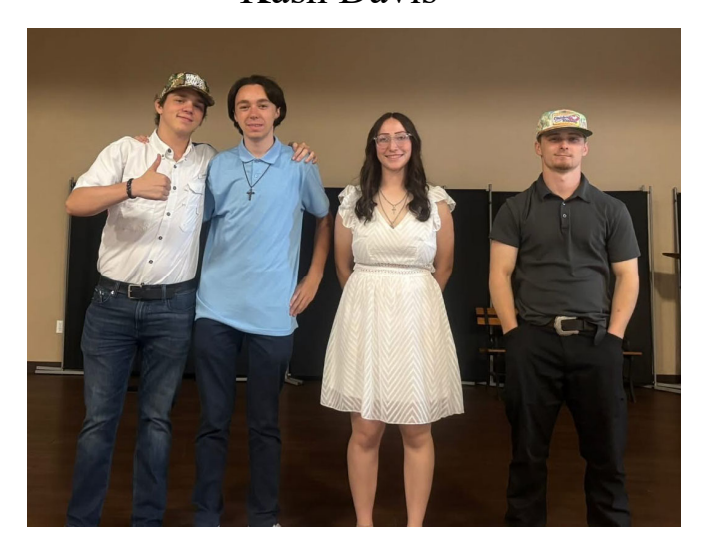
THE CLASS OF 2025